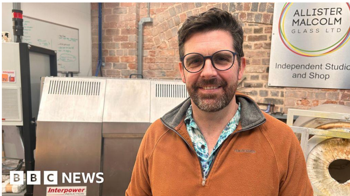
Stourbridge glass studio goes electric after rise in gas bills

With acknowledgements to BBC Radio WM, read the text here and listen to the audio interview here