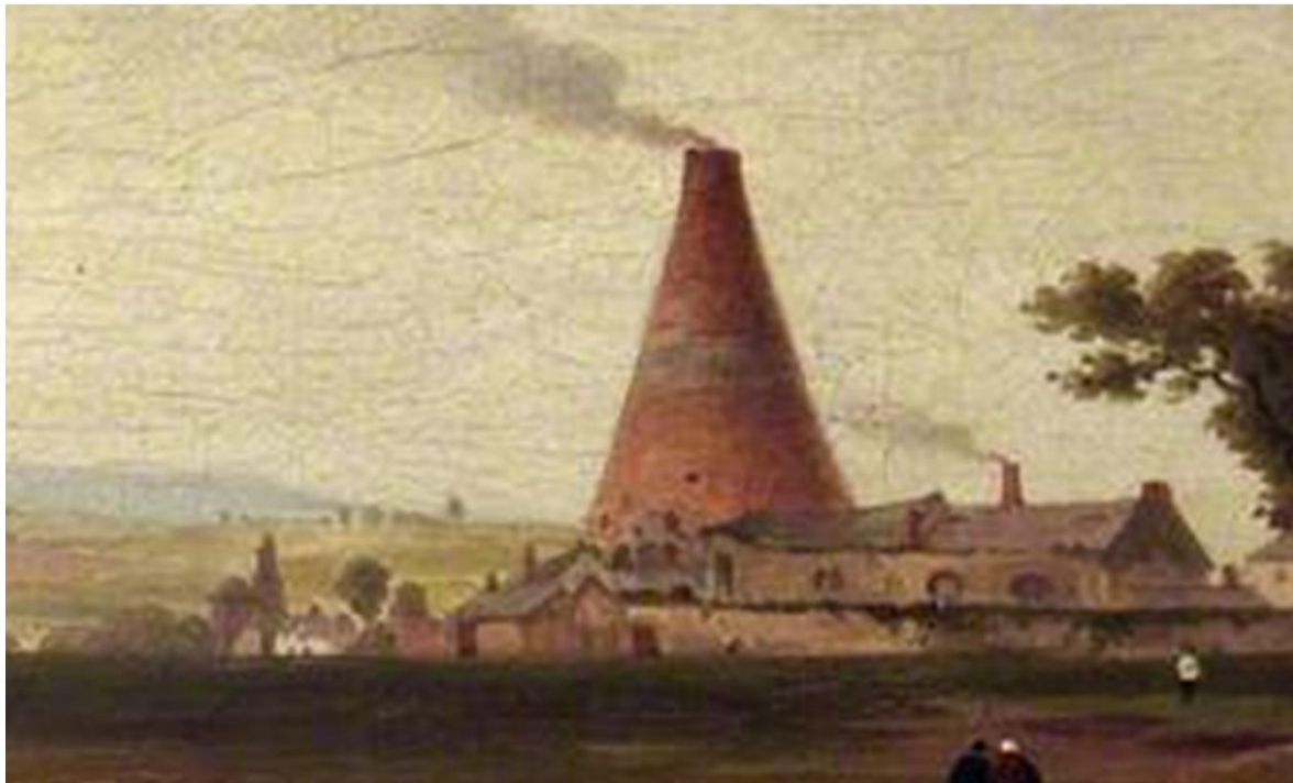
Photo: Loughor Glass Cone, c1760

lechyd da! (We'll let you work that one out for yourself.)